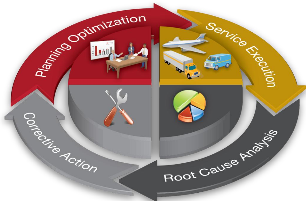
Integrated Planning, Execution, Measurement and Corrective Action

Due in large part to the “ship anywhere anytime” type capabilities that exist today, customer service level expectations are often met, but at the expense of optimal inventory and transportation cost goals. A far better option is to ensure that an integrated SPP and SE process exists and that automated measurement and corrective action plans are in place to drive continuous improvement.